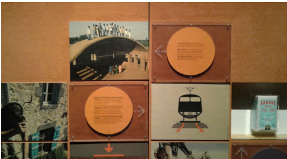
Exhibition at the Musée de Confluences (note AVEI's Deepanam vault!)