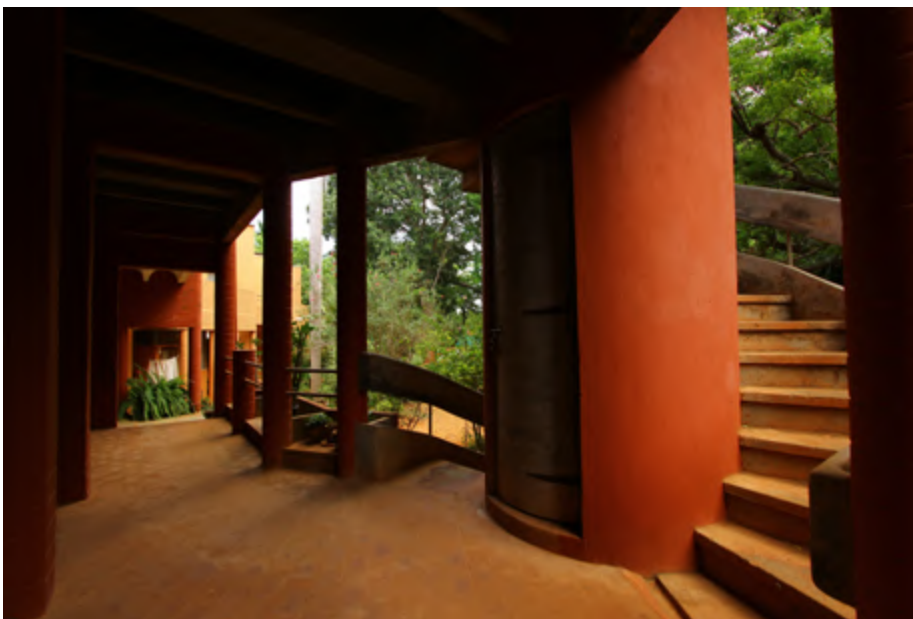
Vikas Community, one of AVEI's projects presented in the Tropical Buildings case studies