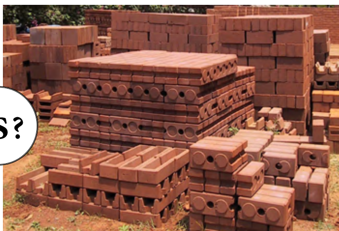
NO Stabilization (e.g. adobe)