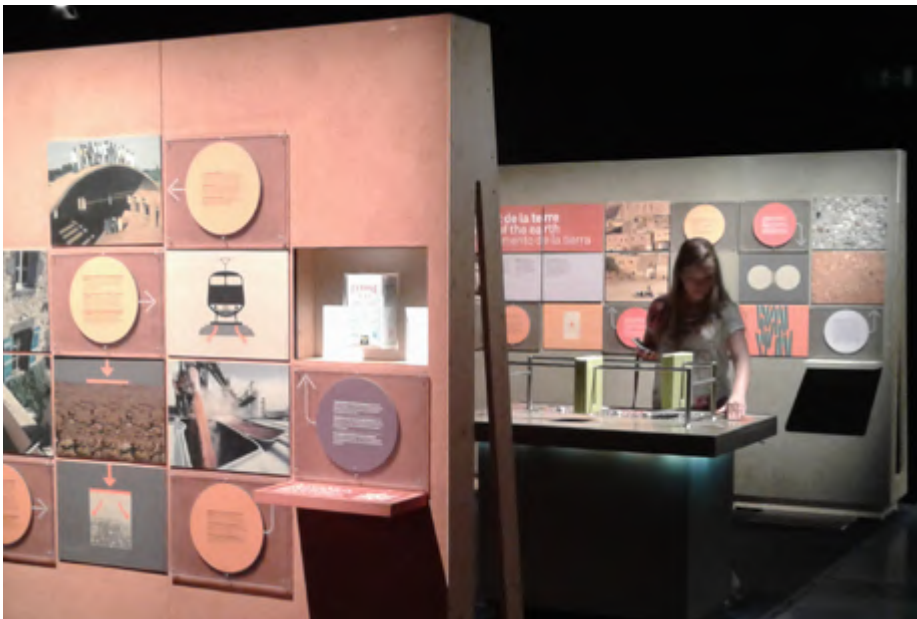
"Modern Earthen Houses: Building Tomorrow" Exhibition, at Musée des Confluences, Lyon