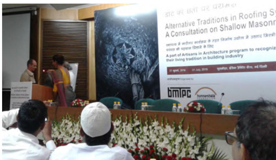
Traditional craftsmen participating in the consultation workshop

Flat domes older than 50-60 years (up to ~300 years) are examples which have stood the test of time against seismic issues by virtue of their massiveness (i.e. extremely thick walls and abutments). This dome typology is inspired from the past and also part of a living tradition. However, much has changed: reduction of wall thickness, introduction of ring-beams with very little steel, use of cement rather than lime-surkhi mortars for speed, casting technique for mortar rather than coursed masonry, much larger mortar joints, and addition of new materials for waterproofing. The participation of the Muzaffarnagar artisans was extremely valuable, on both a technical and a symbolic level.