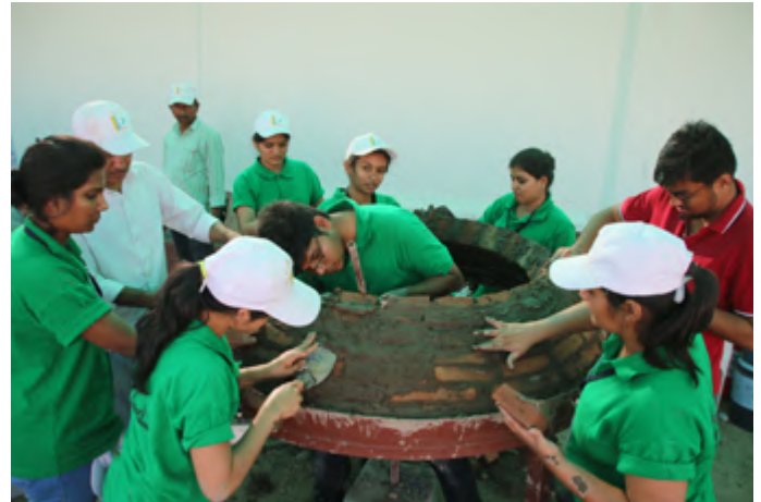
Trainees working on a dome in the Aurangabad AVD workshop