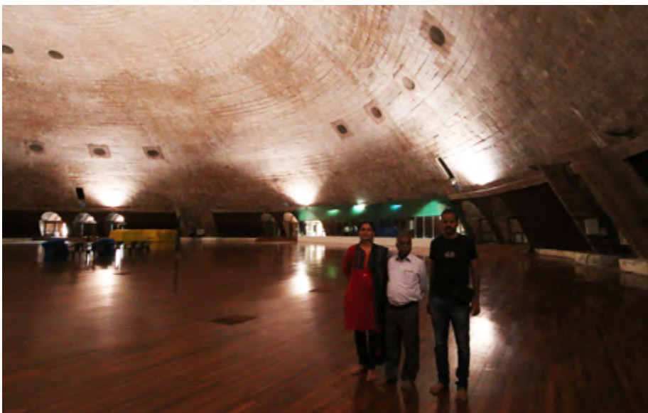
Pallavi, N.R., and Mahesh Varma inside the meditation chamber of the Global Pagoda

in the areas of structural dynamics, structural reliability, design of steel and RC structures, and retrofitting of structures. Currently, he teaches graduate and undergraduate courses, and supervises doctoral and masters research in the areas of performance-based seismic design, structural reliability, design of structural and cold-formed steel, analysis of masonry domes and arches, etc.