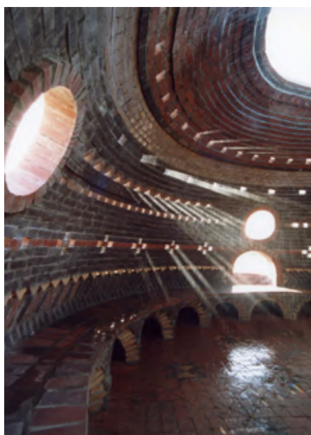
Interior of a Rumi Dome