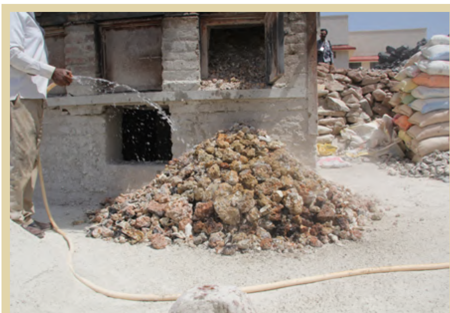
Manufacturing of naturally eminent hydraulic lime by Nandadeep Building Centre