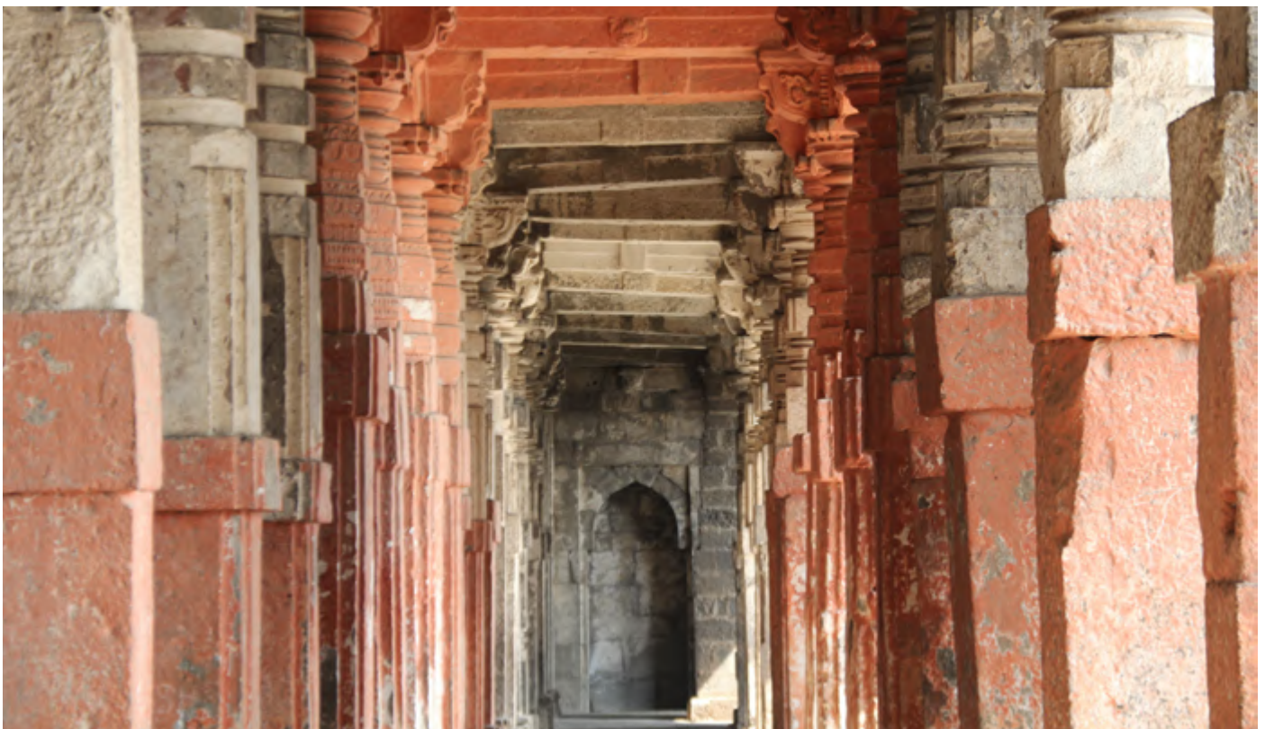
Daulatabad Fort, near Aurangabad - 14th C.

info@earth-auroville.com training@earth-auroville.com