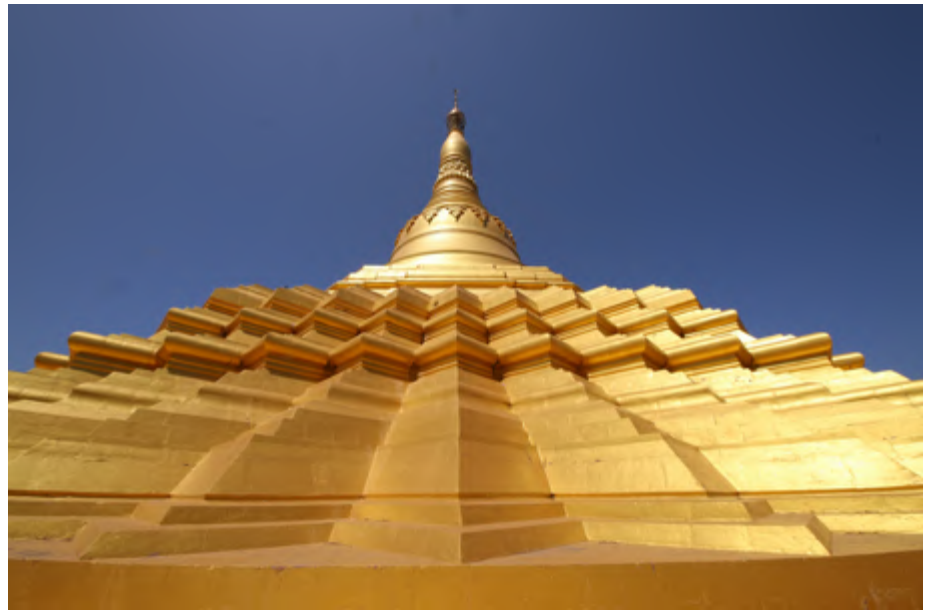
View from the outside of the Global Pagoda

www.earth-auroville.com/global_pagoda_en.php