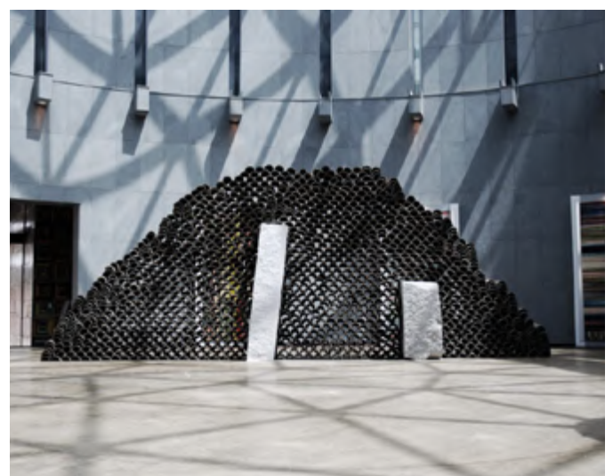
One of Jacques' recent installations