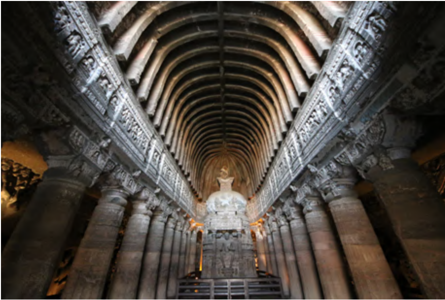
Ajanta, Cave 19, Chaitya gathering hall - 5th C.