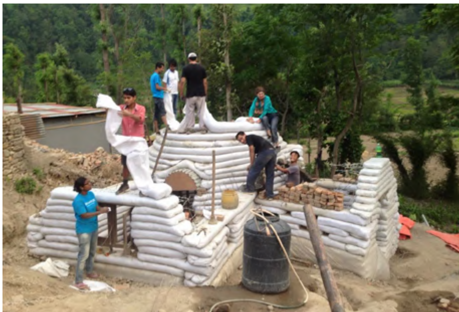
Building with superadobe in post-earthquake Nepal

New Earth (UK)'s philosophy is that "sustainability begins with a person". They offer hands-on education in sustainable living arts and architecture, demonstrating that it is through the act of people building together and by active contemplation of the natural world that one can come to understand what it means to live sustainably. Their innovative techniques draw from ancient traditions yet address urgent current needs, such as disaster-proof housing for communities affected by war and climate change. Inspired by the timeless mysticism of the great masters such as Rumi, Tagore, and others, their work embodies a spirit of collective/community construction, sustainable economy of means and artful mystery in the act of touching and firing the earth.