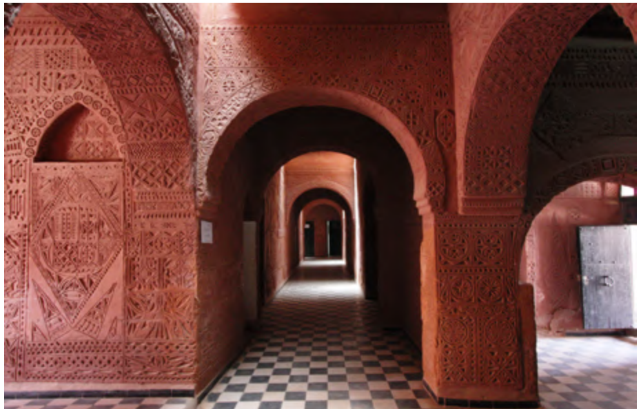
Oasis Rouge in Timimoun, made from adobe and intricate earthen plasterwork