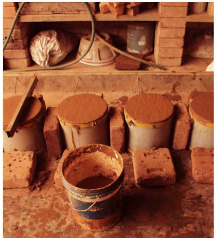
PEC cylinders being cast