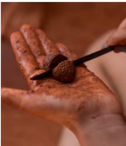
"Sensitive analysis" of soils

This May, the Earth Institute co-taught a new experience course entitled "Earth & Bamboo" with the Auroville Bamboo Centre. Organized by the Auroville Green Practices Workshops, this workshop aims to initiate participants to a variety of earth- and bamboo-based building techniques