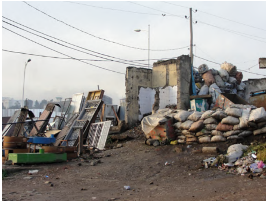
Construction waste - informal systems of reuse

Earth as a building material is already one of the most recyclable materials at large, with the possibility to be fully reconstituted as a building material in its end-of-life