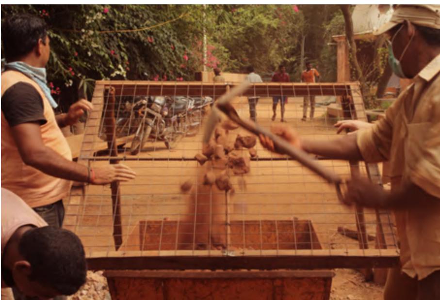
Sieving CSEB waste