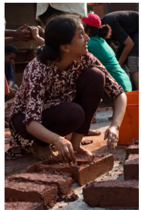
Learning to make sun-dried adobes