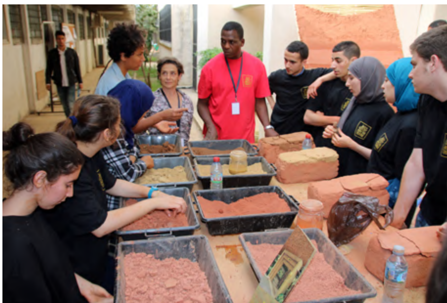
Algerian youth taking part in the Archi'Terre workshops

tural professionals an overview of earthen architecture and its applicability in the modern context. There was also a roundtable discussion between visiting experts and Algerian professors working in earthen construction. A two-day conference was given with lectures presented by international experts. The conference was held a second time in the southern Algerian town of Adrar from the 25th to the 26th of April, situating the festival's vision of heritage architecture and contemporary construction with local materials of this remote desert context.