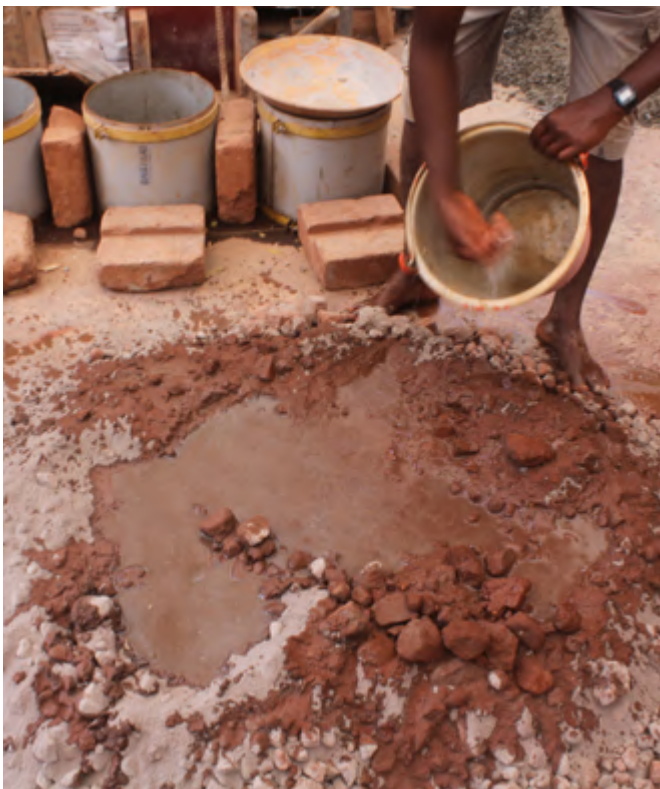
Preparing the PEC mix with CSEB aggregate

"new constructions generate about 40-60 kg of construction and demolition waste per sq. meter, with an average of 50 kg per sq. meter" (an enormous figure), and options of construction waste reuse are virtually non-existent. Meanwhile, the rapid depletion of raw quarried materials such as stone and sand for concrete construction has been putting tremendous strain on the market. By encouraging the industrial scale reuse of construction and demolition waste, with a systematic approach and targets for engineered structures, it may be possible to more sustainably manage both the valuable raw materials and waste resources in India. ■