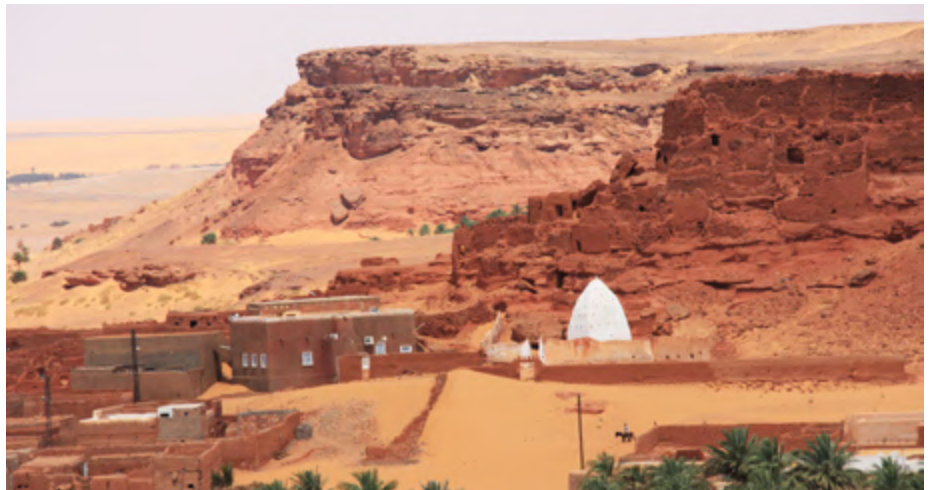
Ksar of Ighzer with a marabout (shrine) in the foreground

This year, after the conference in Adrar, the Ministry of Culture organized a trip for us to visit some of Algeria's unique architectural heritage built with earth in Adrar and Timimoun. The group visited the Ksar of Tamentit (near Adrar), the seat of CapTerre in Timimoun, the Ksar of Timimoun, and made a circuit tour of the cliff around the Sebkhha of Timimoun (including the Ksars of Badriane, Ighzer Feraoun, Tindjelet). ■