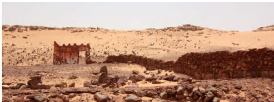
View from the Ksar of Ighzer, near Timimoun, Algeria

info@earth-auroville.com training@earth-auroville.com