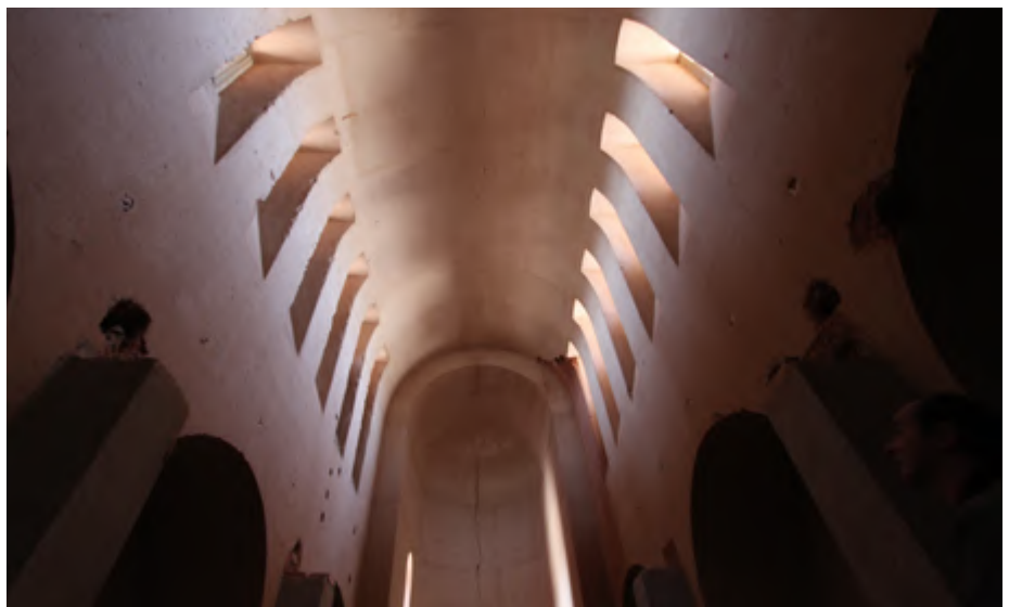
Inside the hospital of Adrar, made from adobe in 1949

This year, after the conference in Adrar, the Ministry of Culture organized a trip for us to visit some of Algeria's unique architectural heritage built with earth in Adrar and Timimoun. The group visited the Ksar of Tamentit (near Adrar), the seat of CapTerre in Timimoun, the Ksar of Timimoun, and made a circuit tour of the cliff around the Sebkhha of Timimoun (including the Ksars of Badriane, Ighzer Feraoun, Tindjelet). ■