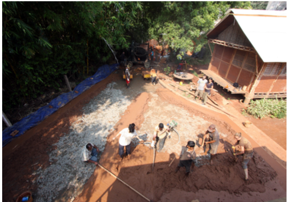
Overview of the road casting

The Auroville Earth Institute has been experimenting with the capabilities of Poured Earth Concrete (PEC) for road surfaces. In August 2014, we completed a first stretch of PEC road (see issue 18 for the full write-up). This road section was a small area of 35.9 m 2 at the entrance to the driveway into the Earth Institute premises. It had very promising results, showing very little cracking and good endurance. A second, larger stretch was therefore planned, and work began at the end of November 2014 with the excavation of a 102 m 2 area further along the driveway. The challenge and goal for this new road section was a large surface area with no split joints; alternatively, in concrete roads, split joints are usually placed every four meters.