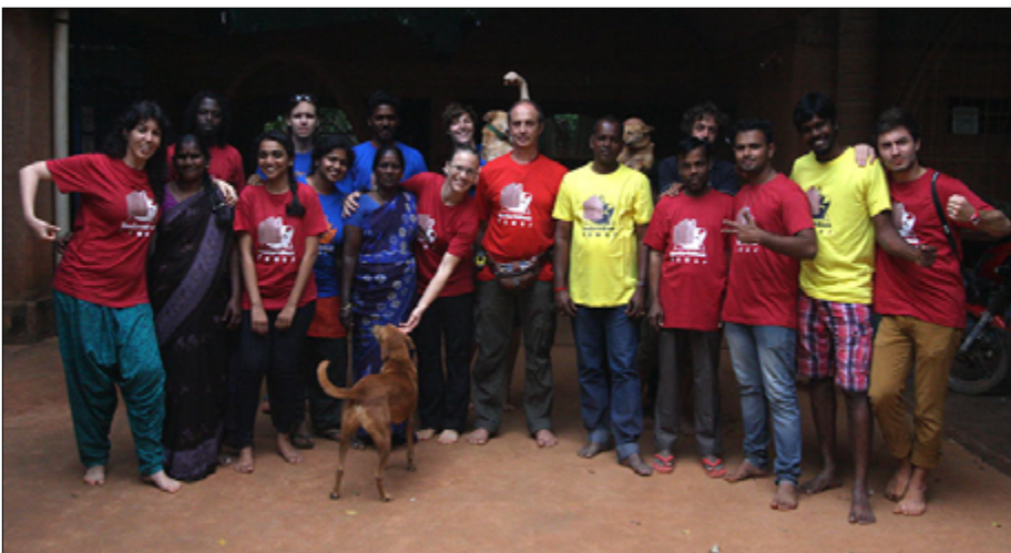
The Earth Institute team sporting the new Earth Block t-shirt

info@earth-auroville.com training@earth-auroville.com