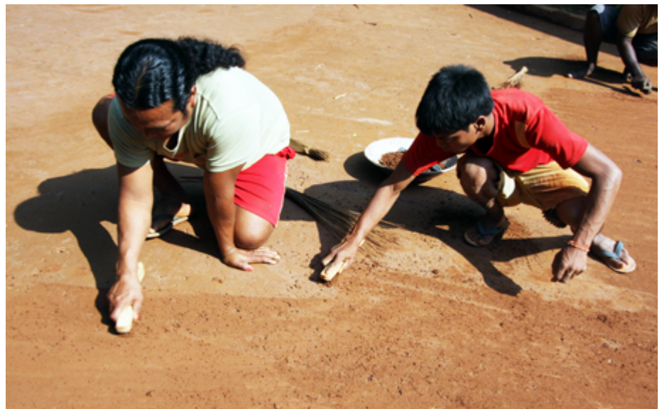
Giving a rough finish to the road with wire brushes