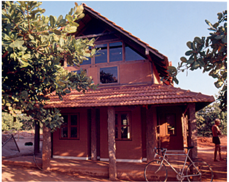
Jaap's family house shortly after construction

allow a mortar-free construction with the use of a stabilized earth grout that is poured into the cavities. This will speed up the masonry work and reduce the cost of construction. ■