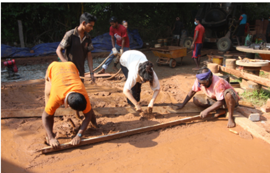
Leveling the PEC with a steel screed bar

The area of the road was excavated over the course of four days. Then a 9 to 10 cm layer of gravel was laid down and a compressor roller passed over the top to obtain a compression ratio of 1.25. In one day, the 15 cm PEC wearing course was cast by a team of 17 people. Eight people were dedicated to the measuring and mixing with the cement mixer. Then another 9 people worked to cast the road, transporting the PEC in wheel barrows, spreading it on top of the gravel, operating the concrete vibrator, and passing the screed bar to level the surface. The perimeter and center strip were cast first as reference levels, however the work-