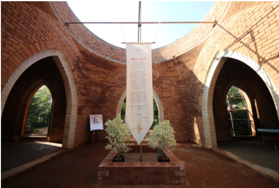
The Sri Vast Ashram Reception Hall is now in the final stages of construction and the first courses have been laid for the dome.