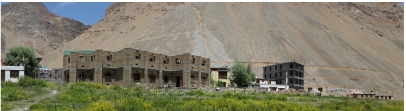
Construction nears completion of the Kaza Community Center, set against the striking Spiti Valley

info@earth-auroville.com training@earth-auroville.com