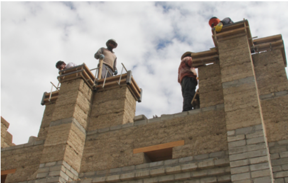
Work progresses on the first story of Kaza Community Center in Spiti Valley