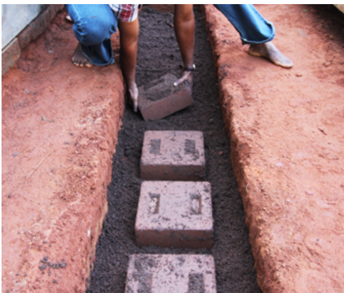
Burying the CSEB in a trench surrounded on all sides by compost

The first evaluation was done in June, seven months (instead of six, for logistical reasons) after the blocks had been buried. All nine blocks were unearthed and