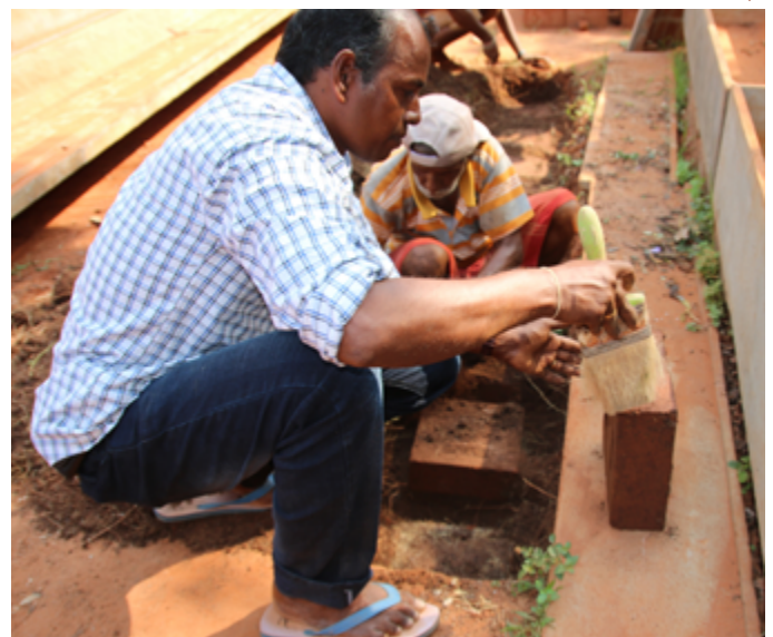
Removing compost residue from the freshly unearthed CSEB