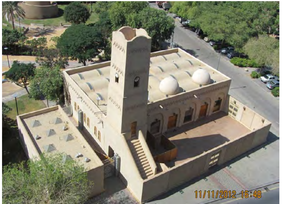
Al-Medy Mosque viewed from above

The Auroville Earth Institute has been nominated to compete in the first ever Abdullatif Al-Fozan Award for Mosque Architecture. This award recognizes exemplary instances of mosque architecture in Saudi Arabia which have been built since 1970. It seeks to appreciate the important role of mosques in modern Muslim societies as a focal point for worship and gathering, as well as an intrinsic part of the urban landscape.