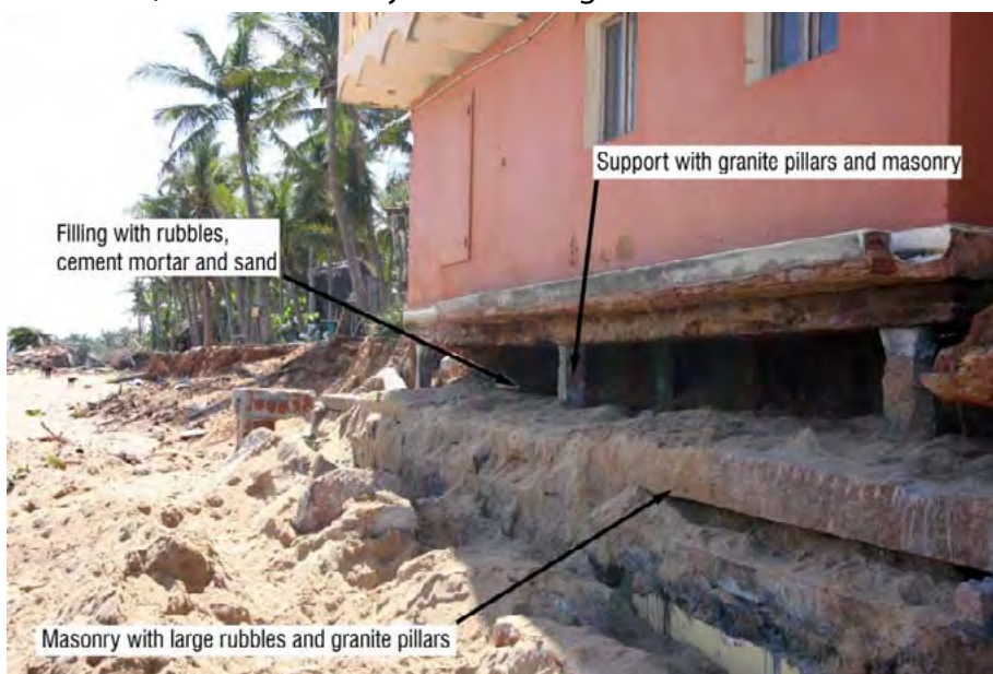
Reinforcement to the foundation done by the AVEI