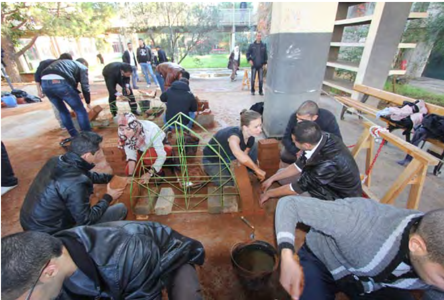
AVD Workshop at the Archi'Terre Conference in Algiers