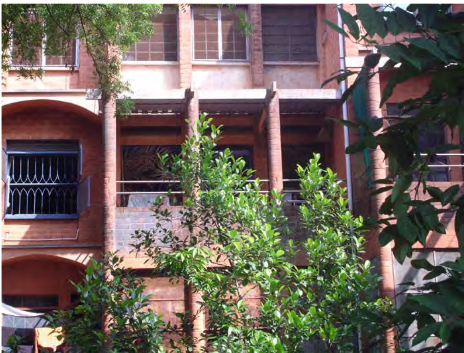
Vikas, an AVEI-constructed apartment complex

With this information, he will be able to compile a report that will provide invaluable information for the development of a popularly accepted form of earth architecture and the improvement of current practices. ■