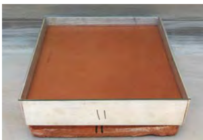
Sample 11, lime but no cactus juice

The proportions for this sample were 1 part lime : ½ part soil : 1 part sand : ½ marble dust. The success of this sample stemmed out of the richness of the lime at 1 part lime to 2 parts aggregates. The Institute intends to conduct further testing on the waterproofing properties of lime-stabilized plasters in the future. ■