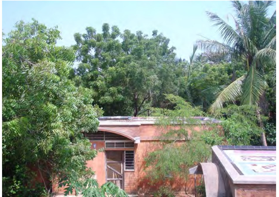
An earthen house in Surya Nivas