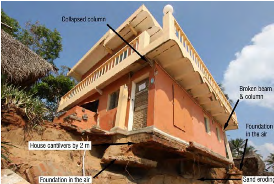
Bhaga's house before the reinforcement work