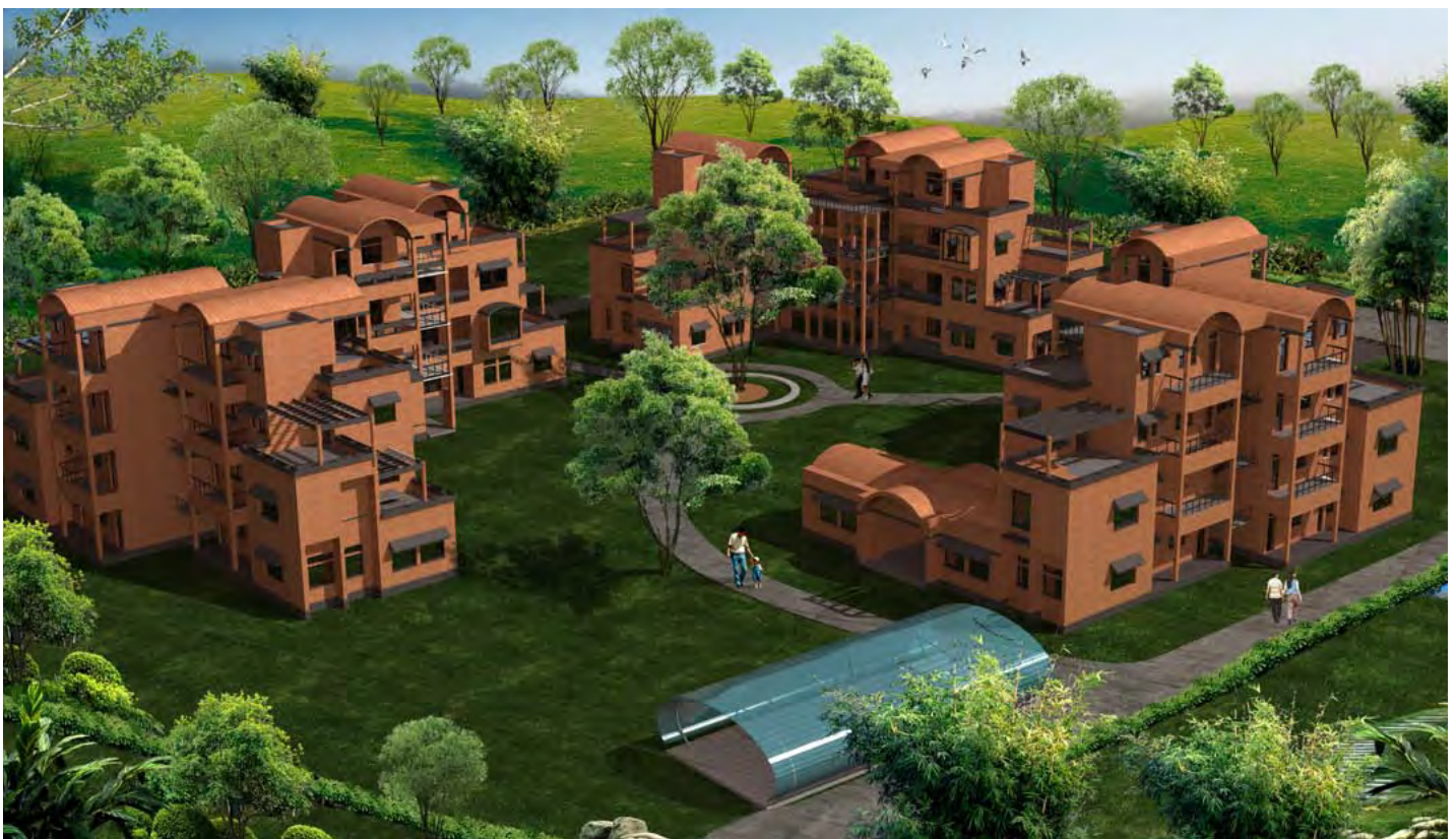
Rendering of Green Casbah