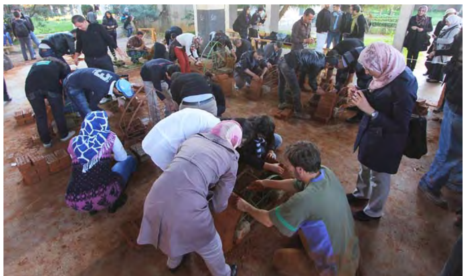
EPAU students constructing arches in the workshop

A beautiful exhibition on earth architecture in Algeria and the world entitled "From Earth and Clay" opened in the Algiers exhibition halls of Riadh el-Feth in conjunction with the conference. It will continue through