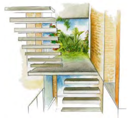
Conceptualization of the stair slab garden

The Institute hopes to be able to secure the necessary participation to commence construction on the first two blocks soon. ■