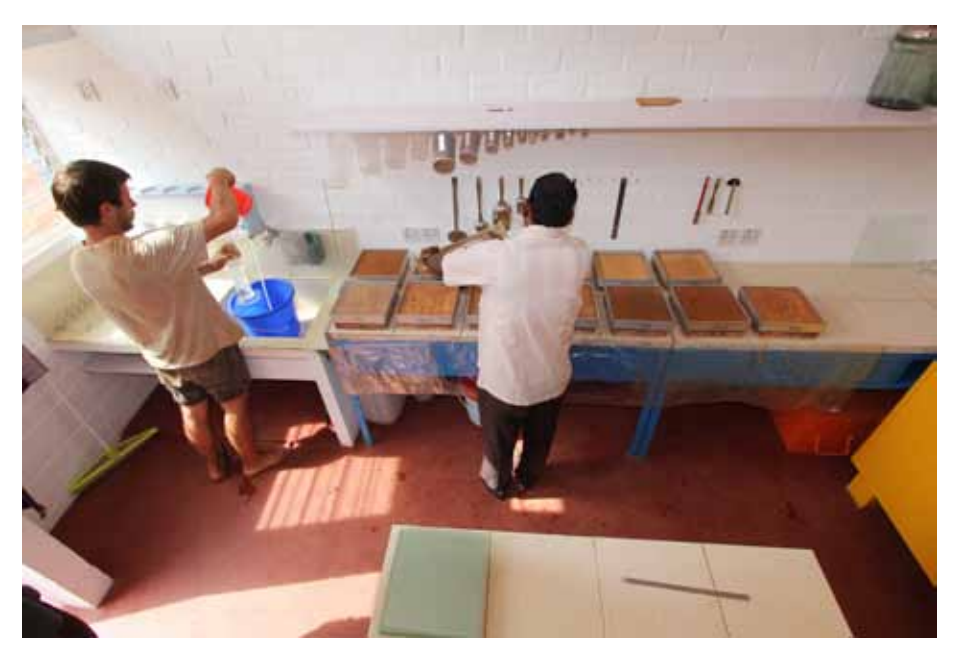
The new AVEI laboratory in full swing