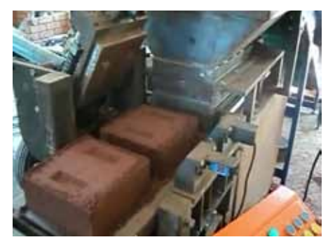
The Auram 6000 compressing blocks

As of September 2012, trial tests are being run on the prototype press, and pilot testing will be conducted in the coming weeks. It has been designed for a theoretical output of 420 Blocks per hour, though The first trial