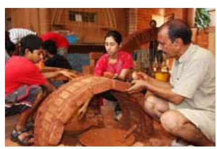
Building an arch during the training

seva': service to man is service to God. As I study the arts of architecture's essential anthropic function in the midst of Auroville's flourishing culture, I have at last been able to understand the union of these two principles, along with the addition of a third: service to man is service to God, and each in their core is comprised of service to the Earth.