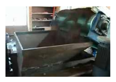
The Auram 6000 sifting dirt

For years, the Auroville Earth Institute has provided manual presses for the production of CSEB in collaboration with the manufacturing company Aureka. The Auram Press 3000 is sold worldwide, including the USA and Europe.