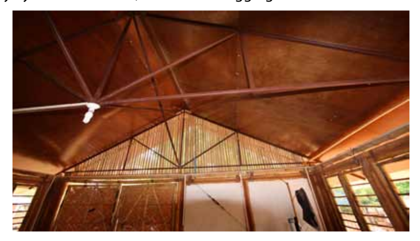
Steel trusses & ply-wood ceiling

In addition to the panel discussions, the festival included an art exhibition displaying paintings, sculptures, pottery, and photographs reflecting Auroville and the artists' relationships with the community.