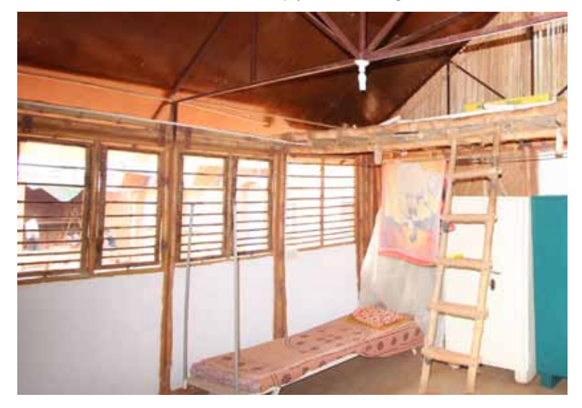
Interior with new lime wash on walls