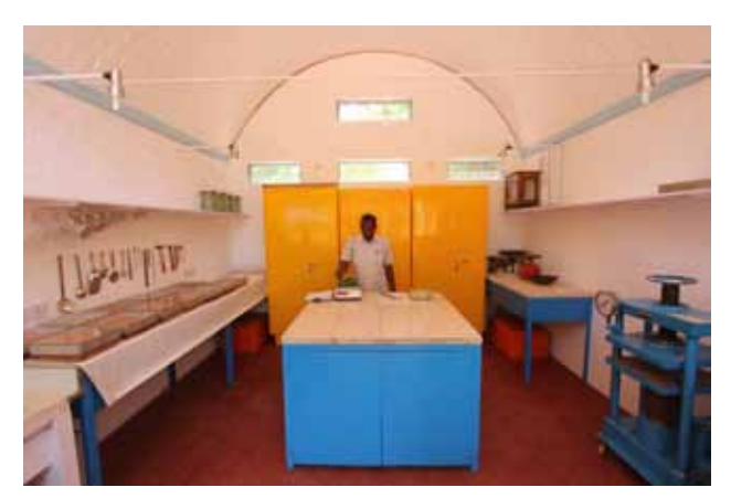
Interior of the laboratory

the Institute called Thermocrete in order to reduce the cracking that results from the fluctuating temperatures caused by changes in solar radiation. It consists of a 5 cm layer of a mix of polystyrene pellets in a matrix of cement and soil, in a ratio 1 cement, 0.5 soil (sieved 2mm), 5 polystyrene, and 0.65 water. This insulation is applied on top of the waterproofing as it is meant to reduce the thermal expansion of the latter and the vault below. The laver of thermocrete is protected by a layer of 1.5 cm thick of lime stabilized earth plaster.