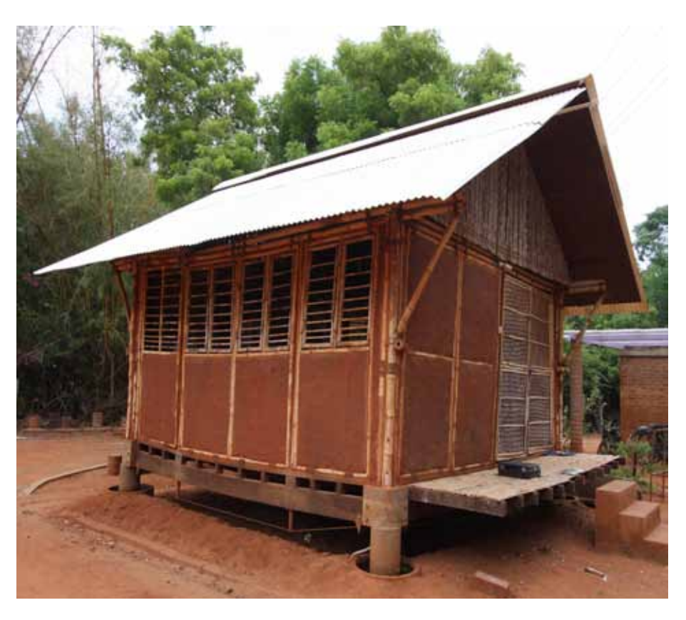
The completed Bamboo House

The Auroville Earth Institute finished the renovation of the model bamboo house located on the AVEI premises at the beginning of September. This house is the product of collaboration between the AVEI and the Auroville Bamboo Research Center in 2009 which aimed to provide a low-cost and temporary housing solution for tropical climates using local materials. In the wake of Cyclone Thane, the bamboo house was damaged and needed repairs to the roof. The opportunity was also taken to make several structural and aesthetic improvements.