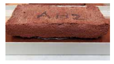
Adobe Brick with Cactus Juice after 90 hrs

but did include the most lime and a high ration of soil sand: One litre of water took 17 days and 13 hours to percolate through this sample.