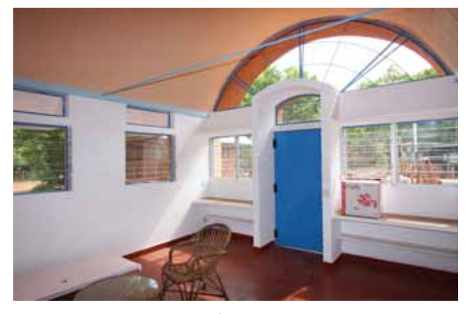
Interior of the dormitory