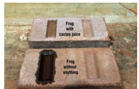
Frogs of Two Bricks Filled with Water

A third test studied the water absorption in the frog of a brick, and the indentation was filled with water and observed.