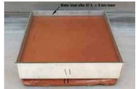
Water Absorption Test on a Sample

Another test was performed upon a cup made of clay mixed with cactus juice, which was filled with water and analyzed for its ability to hold form and resist leaking. But after 1 h 17 minutes the cup totally desintegrated.