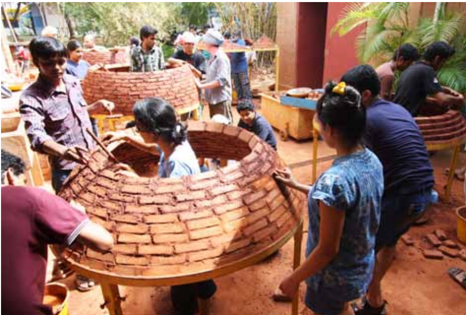
Intensive AVD Course at the Institute