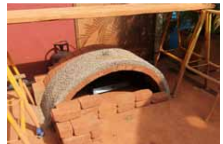
Heating the Vault

The test panels were analyzed for workability, a uniform consistency, and lack of air pockets. Due to the sloping form of a vault, the mixtures were also tested for slumping, and additionally for shrinkage.