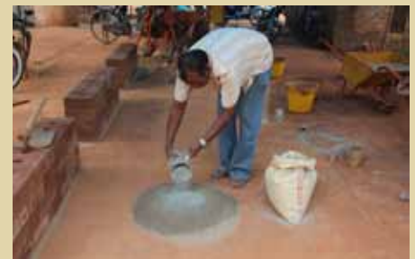
Mixing the Grout

has shown that this works much better and gives a stronger hold.