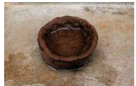
Clay Cup Exhibiting Leakage

Another test was performed upon a cup made of clay mixed with cactus juice, which was filled with water and analyzed for its ability to hold form and resist leaking. But after 1 h 17 minutes the cup totally desintegrated.