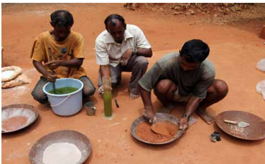
Preparation of the Adobe Bricks

To test these samples, a liter of water was poured on each sample and a pane of glass was sealed over the top to minimize the evaporation of the water. The aim was to test the absorption and percolation of water in the context of the varying samples.