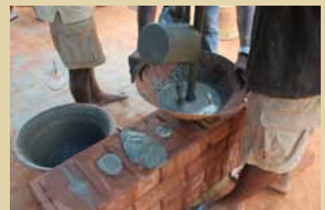
Pouring the Grout

The proportions of the grout have also been changed to 1 part cement, 3 parts sand, and 1.2 parts water.