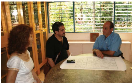
Meeting at the Earth Institute

In February, representatives of the Aurovillage in Burkina Faso visited the Auroville Earth Institute with the aim to establish a partnership between AVEI and the Aurovillage.