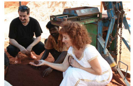
Learning about the blocks