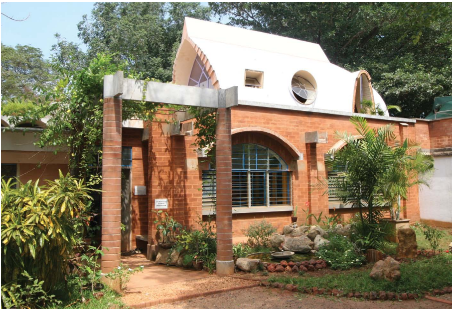
Office of the Auroville Earth Institute (AVEI)